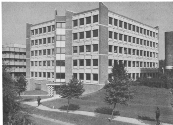
The building that houses the EORTC.

The new building is in Woluwe-St-Lambert on the outskirts of Brussels. In this building, EORTC rents a floor which comprises 1200 m 2 , and is fully equipped with integrated telephone and computer links. As well as offices for the staff there are meeting facilities. The high-tech design is a reflection of the professionalism of modern science. This investment in a new headquarters is a sign of the importance that fund-raisers and sponsors attach to cancer research and treatment in Europe.